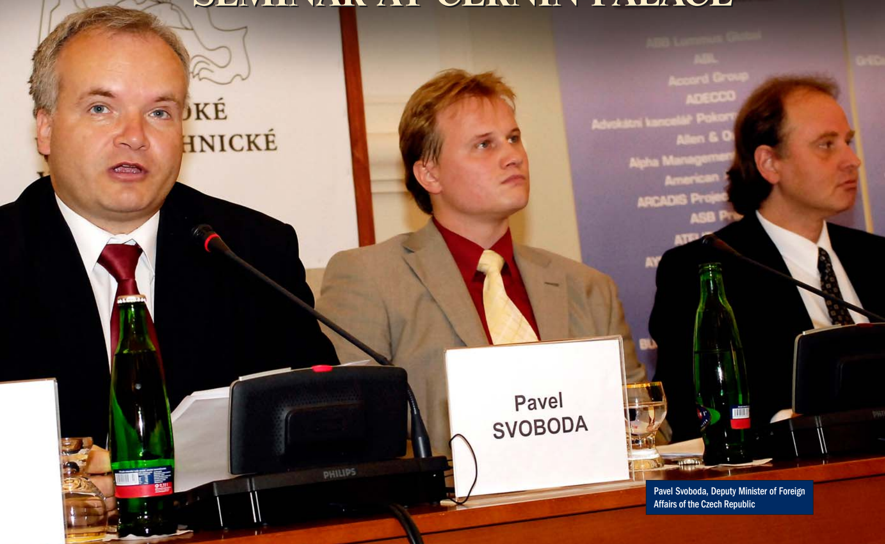
Pavel Svoboda, Deputy Minister of Foreign Affairs of the Czech Republic